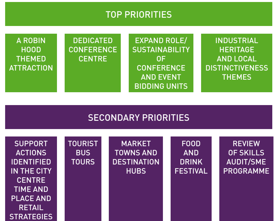
FIG 9: TOP PRIORITIES

The top priorities identified for Nottingham and Nottinghamshire are: