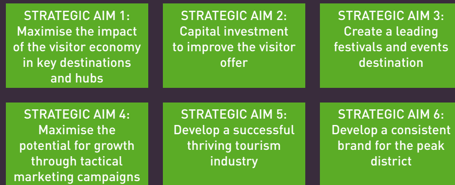
FIG 10: TOP PRIORITIES

The top priorities identified for Derby and Derbyshire are: