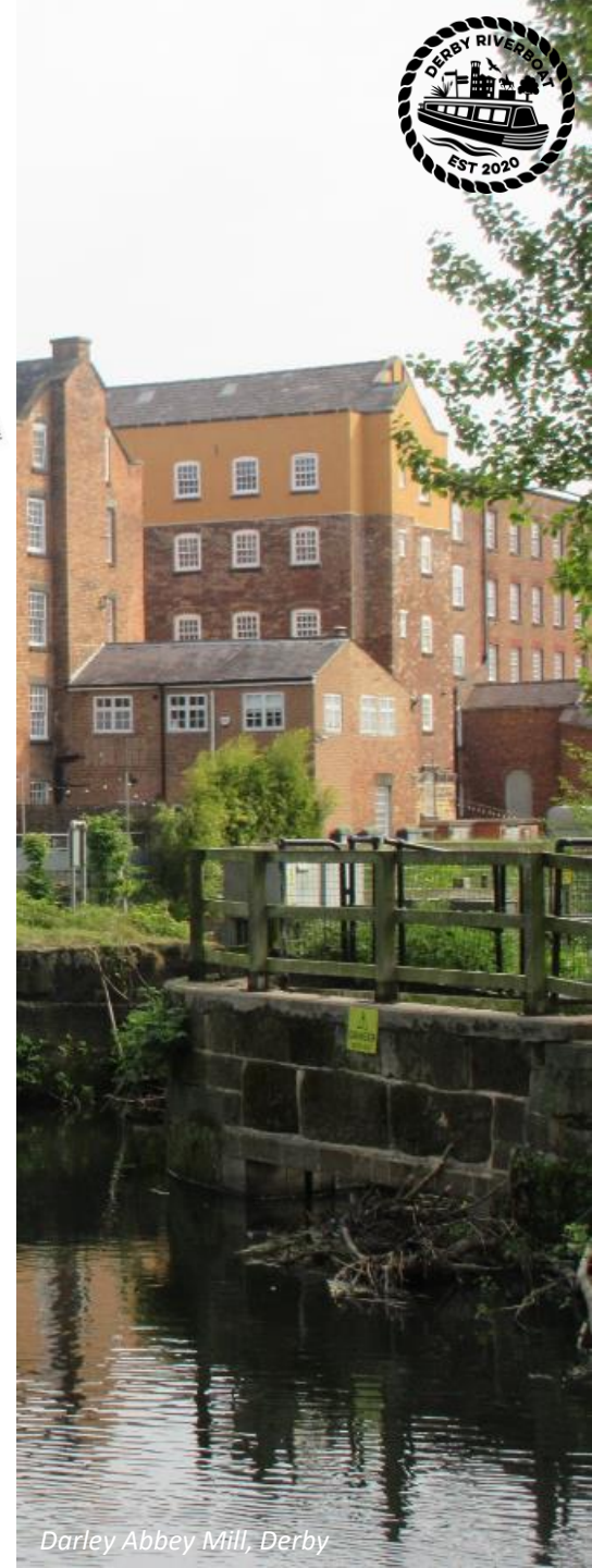
Darley Abbey Mill, Derby

ALL WEATHER CRUISING: Passengers can choose between indoor and outdoor seating areas. So whether you decide you want to relax in the fresh air on the foredeck on a hot and sunny day or retreat to the covered, warm cabin when it's cooler the choice is yours. All areas of the boat are fully accessible to wheelchair users.