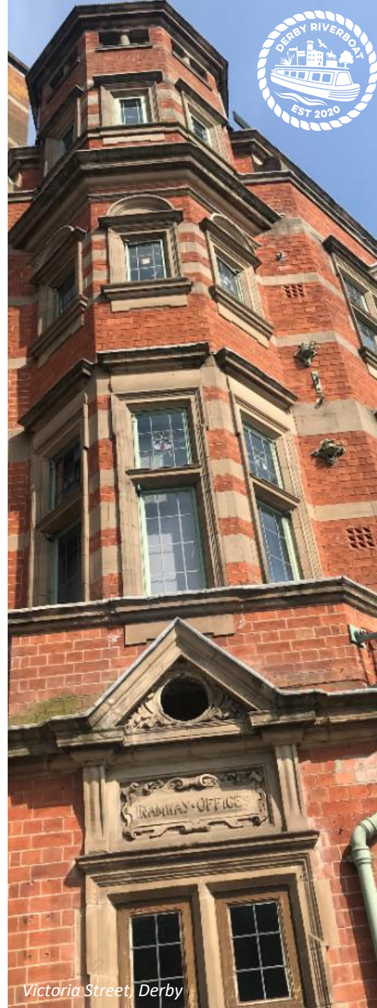
Victoria Street, Derby